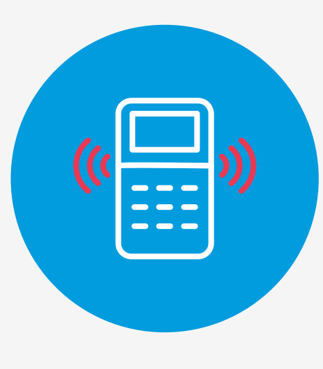
On-board open window sensing technology