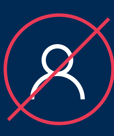
Reduced human intervention