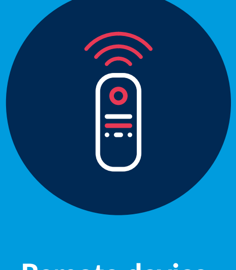
Remote device control