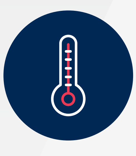
0.2°C accuracy thermostat