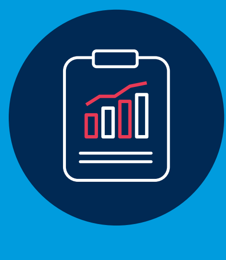
Energy usage reports