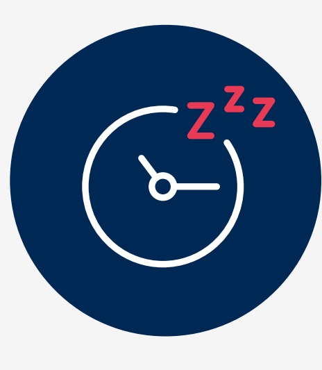
Adaptive start technology